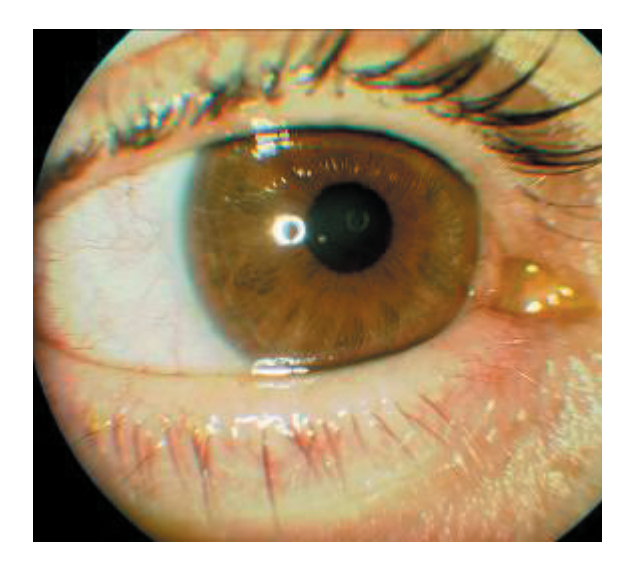
Figure 2. Conjunctival granuloma